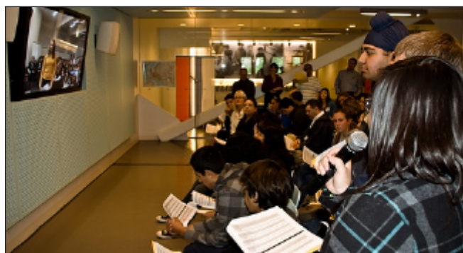
More than 2,000 students and over 25 teachers from the Los Angeles-area connected with schools in Lithuania, Russia, and Serbia through student conferences, video conferences, and teacher exchanges.

The Summer Law Institute. SLI offers a week-long summer program for high school students interested in learning more about the American legal system. Co-sponsored by the California Bar Foundation and the UCLA School of Law, the 2008 SLI attracted 49 high school students and awarded many participants with scholarships.