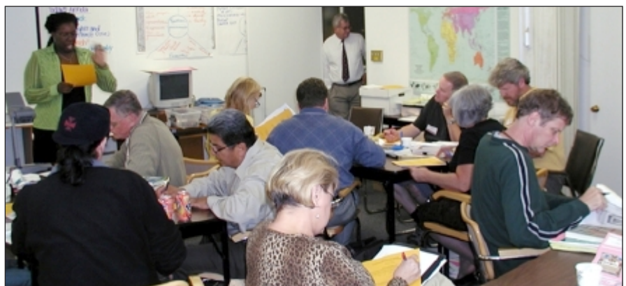
CRF's Teaching American History program provided hundreds of teachers in more than 10 school districts with U.S. history resources designed to support classroom instruction.