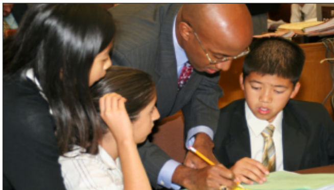
Our Lawyer in the Classroom programs provided students with a deeper understanding of the judicial system by connecting them with members of the legal community.

The Appellate Court Experience provided students with an opportunity to observe portions of a criminal appeal, meet with presiding justices at the California State Court of Appeal, and engage in classroom activities.