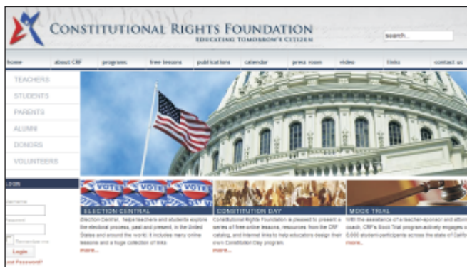
CRF's materials, publications, and web site reached nearly 2.4 million students annually.

Publications. CRF's data-collection instruments estimate that CRF materials and publications reach nearly 2.4 million students annually. In 2008, CRF published the revised Current Issues in Immigration 2008 for use by teachers in addressing these important and timely issues in their classes. The online version of Current Issues received over 16,000 individual page views. CRF's signature newsletter, Bill of Rights in Action , reached over 30,000 educators with three new issues to help teachers and students with content-rich, standards-based curriculum supplements. Issues addressed the themes of Intellectual Property, Reform, and Politics and contained articles on such diverse topics as digital piracy, Communism and democratic reform in China, and the origins of political parties in the United States.