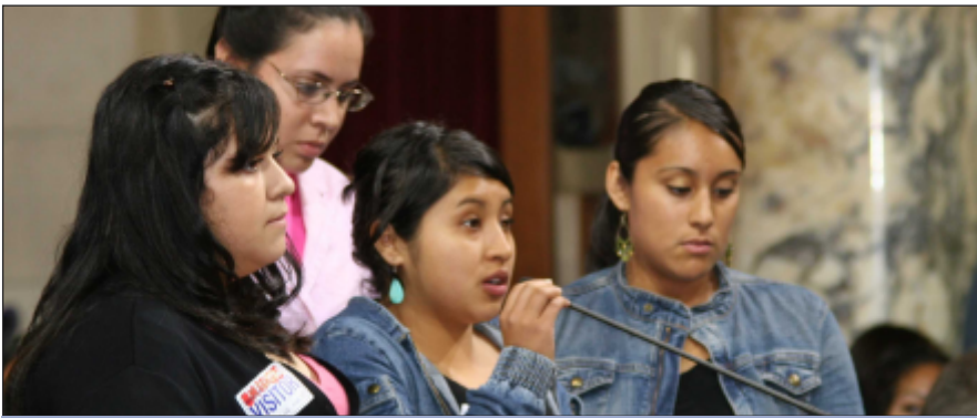
The annual Free Expression in a Free Society academic competition challenges students to research and create video projects that explore themes and events related to freedom of speech.