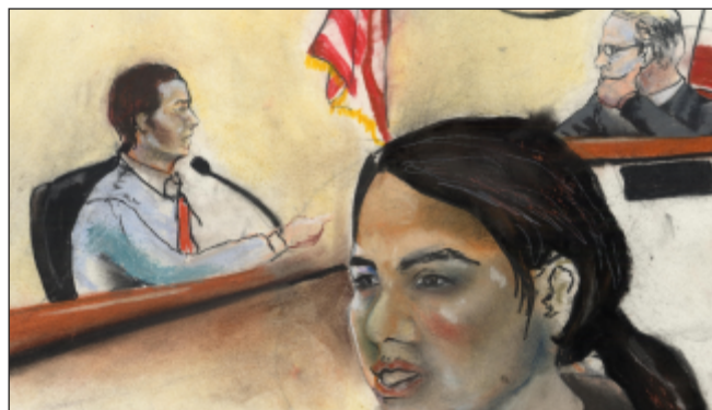
The State Mock Trial Competition involves over 10,000 students and 3,000 judge, lawyer, and teacher volunteers.

Expanding Horizons Internships. This CRF program places qualified urban students in law firms, businesses, government offices, and non-profit organizations. The program empowers young people to serve as school and community leaders while they gain valuable paid work experience and college preparation. In 2008, the program placed 105 local students in Los Angeles-area offices.