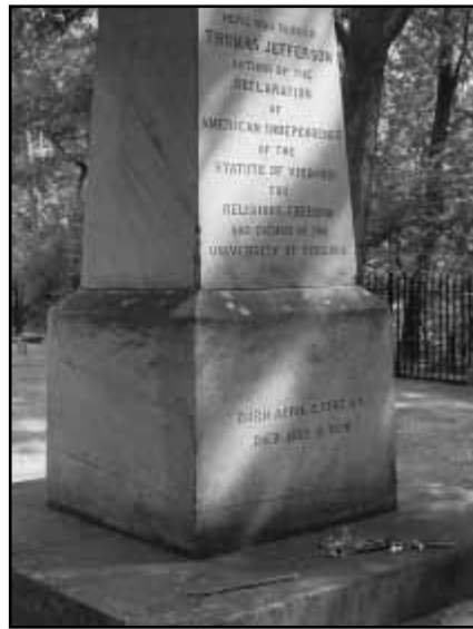
Thomas Jefferson is buried at Monticello, his Virginia estate.

This is the preamble to Henry's modified version of the General Assessment bill. It sets out his reasons for supporting his bill.