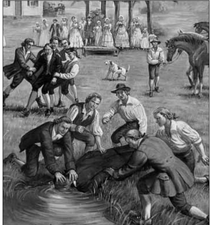
A wave of religious persecution took place in Virginia in the 1770s. This oil painting shows a group of Anglicans attacking two Baptists.

In New England, colonists also passed laws involving the government in religion. Most of the early settlers in Massachusetts, Connecticut, and New Hampshire were Puritans who belonged to the Congregational Church. For the first 50 years in the Bay Colony—which became Massachusetts—no resident of the colony could vote unless he belonged to the Congregational Church. Later laws