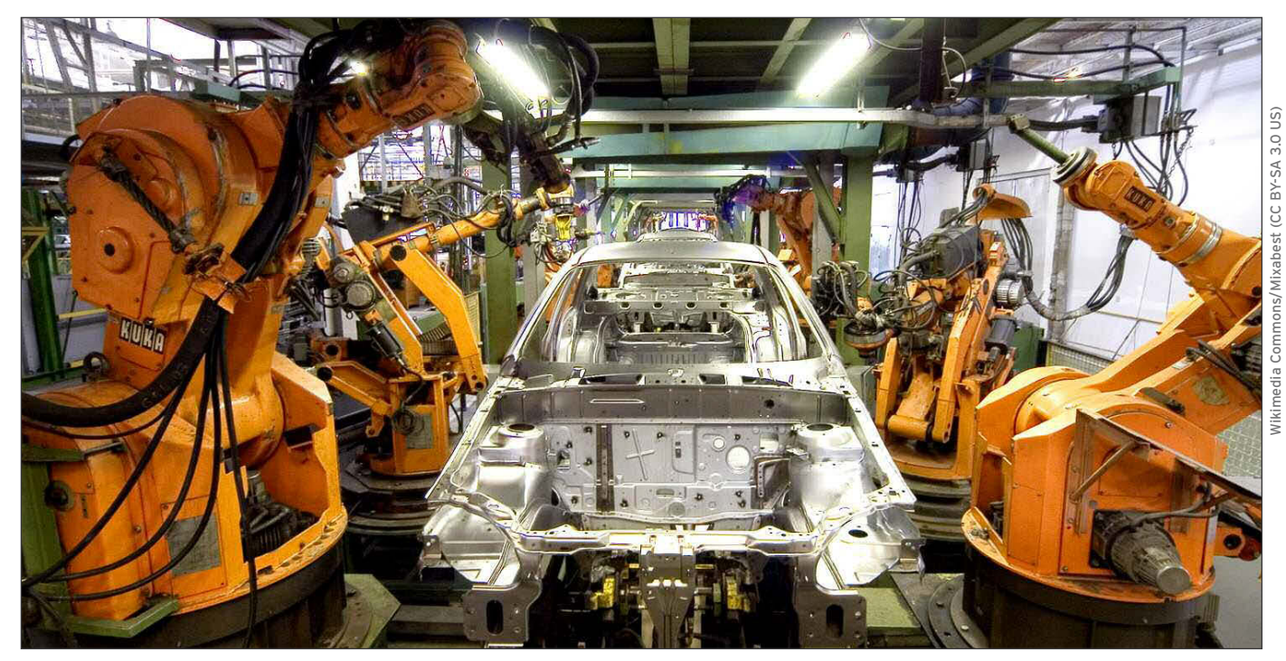
Industrial robots have been increasingly used in automobile manufacturing in recent decades.

Since the Industrial Revolution, machines have eliminated jobs, but they also have created new ones. However, some argue today that new automation forms like robots and artificial intelligence are not just affecting jobs, but are becoming the workers themselves.