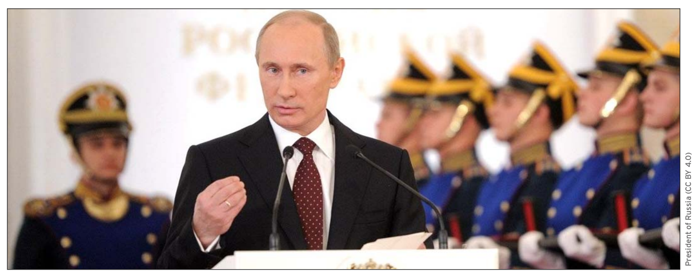
Russian President Vladimir Putin speaking at the Grand Kremlin Palace in Moscow in 2012 for the Russian Federation National Awards.

If you are a citizen of Russia today and you join an unauthorized demonstration or protest, you may be fined $9,000 and face years in prison. If you plan a demonstration but fail to first get approval from the government, or if a demonstration for which you obtained approval causes property damage, you may be in for a much bigger fine and hard labor.