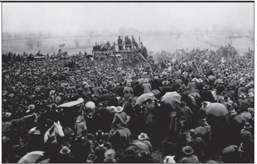
Lynching of a black man accused of murder in Paris, Texas, in 1893. The exceedingly large crowd shows this is a “spectacle lynching.”

One important result of her lectures in Britain was the formation of the British Anti-Lynching Committee. Members wrote letters to southern governors and other politicians, pressing them to enact anti-lynching laws or face losing British bank loans and investments. Some southern states did pass such laws, but their enforcement was often weak.