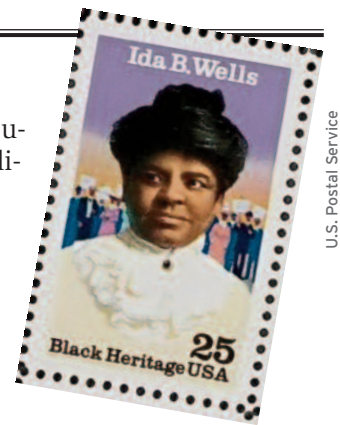
U.S. Postal Service